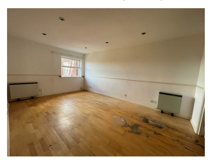
Wood floor, recessed spotlighting.