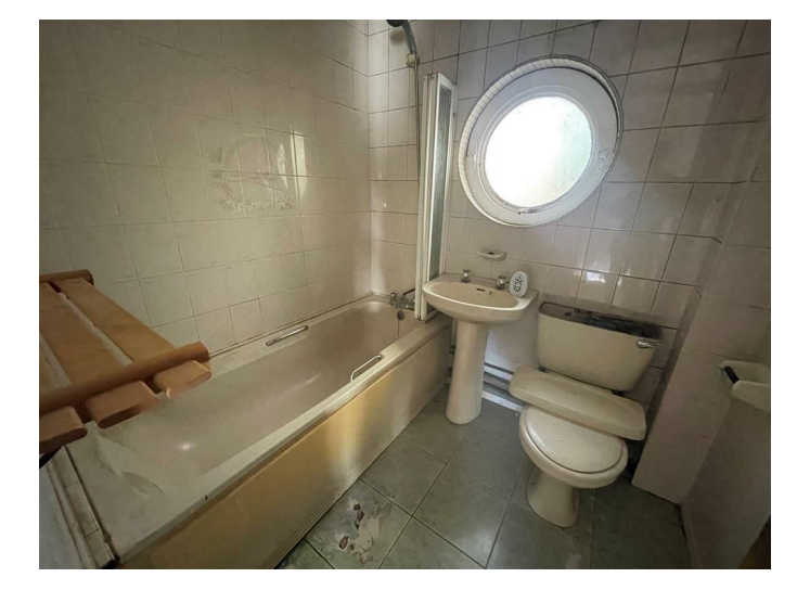
Panel bath, low flush W.C, wash hand basin.