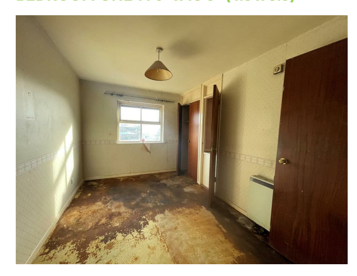
Built in storage.