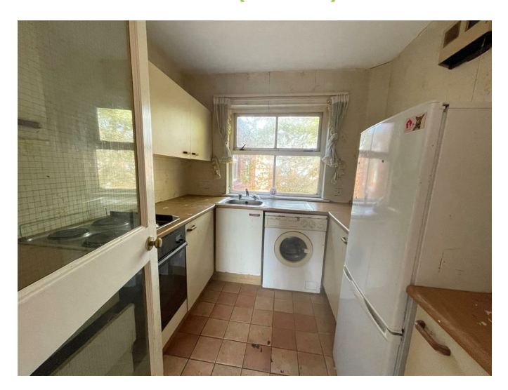
Range of high and low level units, plumbed for washing machine, tiled floor.