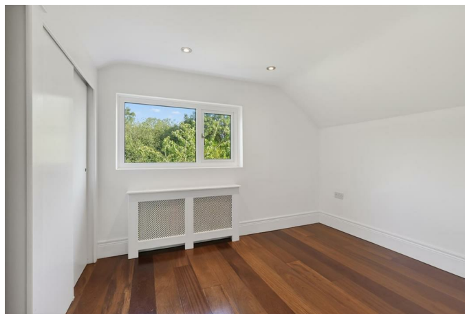
BEDROOM THREE 12'5" x 8'10" (3.8 x 2.7)