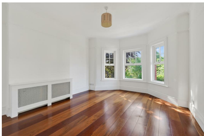
MASTER BEDROOM 15'5" x 11'9" (4.7 x 3.6)