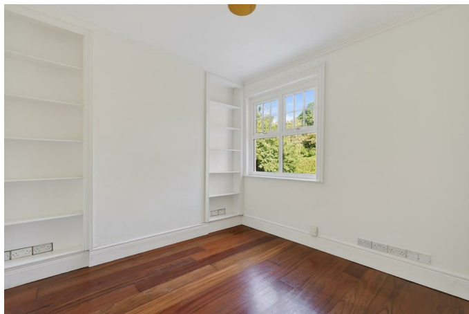
LIVING ROOM 11'5" x 10'9" (3.5 x 3.3)